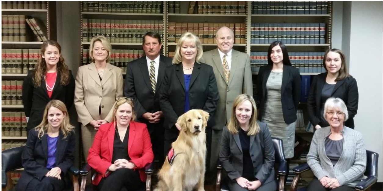
Staff of Fauquier County Commonwealth Attorney's Office with facility dog Lincoln.

Compared to receiving services at a children's advocacy center, participating in the prosecution of a case can seem like running a gauntlet for the children and their families. Think how much easier it would be if a facility dog were there to welcome them when they arrived for the meet and greet with the victim advocate, the interview with the prosecutor, then the interview with the defense attorney, pre-trial motions, testifying in court and sentencing. When a dog is involved, kids often ask when they can come back and see the dog instead of dreading a return visit.