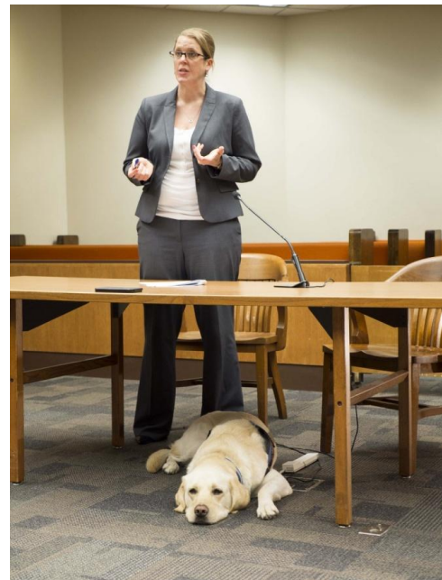
Astro demonstrating perfect courtroom decorum.

If that request is not granted, offer to show the judge and defense counsel the Courthouse Dogs Foundation introductory DVD, which contains interviews with judges who enthusiastically describe how well the dogs behave in the courtroom, with one judge adding that he wished the attorneys behaved as well as the dog.