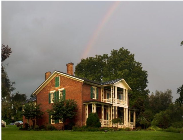
At the end of the rainbow is the Children's Advocacy Center of Bristol/Washington County, VA.