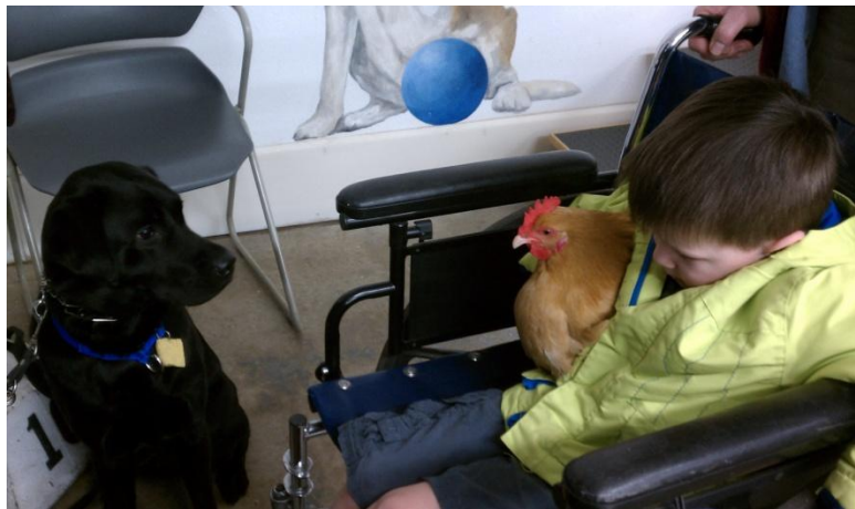
CCI puppy-in-training being introduced to wheelchair, child, and chicken all at once.

Most assistance dogs are “puppy raised” during the first 18 months of their life by either a family or a prison inmate participating in an accredited training program. All through their early months of life the dog is guided carefully to learn to be obedient and to look on everyone in the world as a friendly warm person. These dogs are not protective and do not exhibit a strong prey drive that would cause them to be distracted by squirrels or cats or other fast moving items.