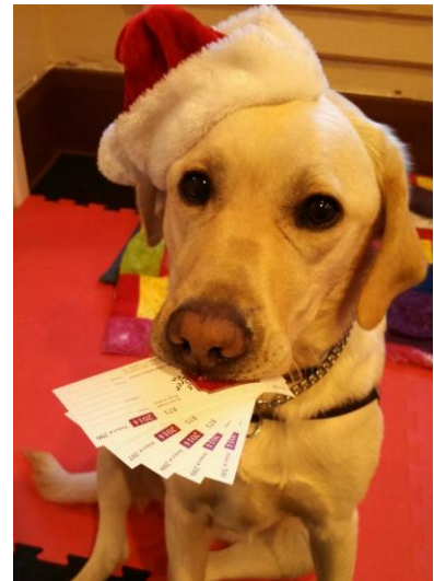
Nomad sold a lot of tickets for the fundraising gala.

At our fundraising gala this December, Nomad was available to greet guests all evening. He was dressed in his vest, of course, but had a “tuxedo” with a plaid bowtie attached to the front of his collar for the festivities. He carried a basket of small lint rollers around to distribute, since most everyone was dressed in black cocktail attire and he is yellow. Each lint roller had a Christmas tag on it, so he could then put the basket down on the floor, remove a lint roller by the tag, and give it to the guest. He then picked up his basket and continued through the crowd. During the live auction portion of the evening, when it was time to “Fund the Mission”- Nomad came up on the stage and carried in his mouth a letter he wrote to Santa asking for financial support for his work at the center that the auctioneer read to the crowd. We then opened the bidding for a donor to fund the facility dog program for the coming year, in exchange for a Virginia tax credit (and the typical federal tax deduction for charitable contribution). When the bidding started to slow down, Nomad walked to the crowd and got in the “up” position at the table of the bidder who was wavering, and looked her in the eyes. A definite crowd pleaser! This year we raised $13,300.