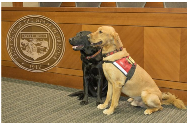
Blake and Russell on duty in the courtroom.