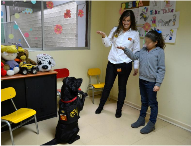
Children feel empowered when a dog performs the tricks they ask them to do. This is Peseta, trained by Bocalan Confiar, an assistance dog organization in Santiago, Chile. Peseta lies next to children in hearings at Family and Criminal Courts.

While in the lobby area, allow the child and dog a few minutes to interact with one another.