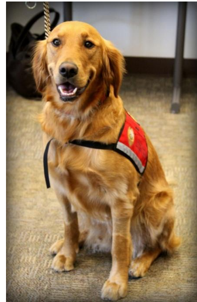
Russell, trained by Assistance Dogs of the West (ADW), has great enthusiasm for the work he does.