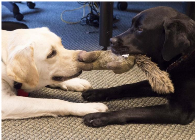
Facility dogs Astro and Molly play at the Monarch Children's Justice and Advocacy Center.

Another factor to consider is how to provide adequate exercise for your dog. Most Labradors and Golden Retrievers will be better able to settle down to work if they have had a brisk walk or an