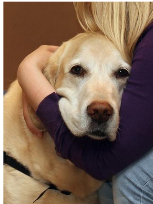
Jeeter, trained by Canine Companions for Independence (CCI)

Facility dogs that work in the legal system can provide a sense of calm, security, and non-judgmental support during investigative and legal proceedings when the professionals have to respond to children in an impartial