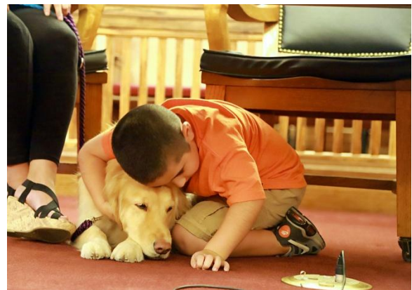
Emma, trained by Assistance Dogs of the West, comforts kids in court in Roswell, New Mexico.

"In courtroom testimony, safety and sensitivity to timing and pacing are not what drives the questioning process. In fact the court process embraces aggressive argument, strategic and selective presentation of facts, and in the case of child witnesses the use of developmentally inappropriate, complex language, and repeated questions with subtle variations for the purpose of demonstrating inconsistencies in the verbalizations of young