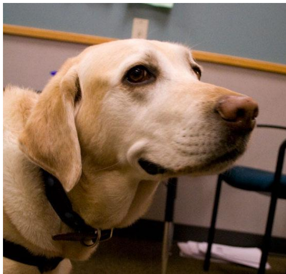
Ellie is always ready to play