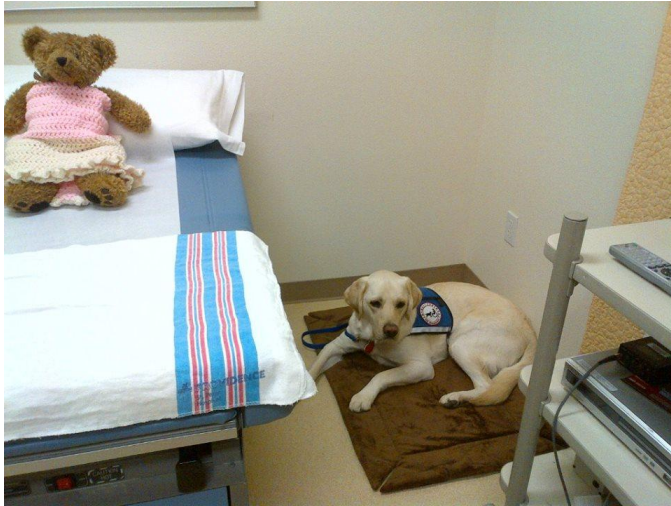
Facility dog Astro, trained by Assistance Dogs of Hawaii, in the exam room at Monarch Children's Justice and Advocacy Center in Lacey, WA.

A number of children's advocacy centers have found that allowing a dog to accompany a child during a medical exam has resulted in a better experience for the child, as well as a reduced time for each exam. However, some physicians and some Sexual Assault Nurse Examiners have expressed concerns about the contamination of collected evidence by dog hair. It will be up to the medical staff of each CAC to determine whether the facility dog should be present during forensic medical exams. The dogs that are utilized in medical exams are often given extra-long leashes, so that the child can hold onto the leash while on the exam table.