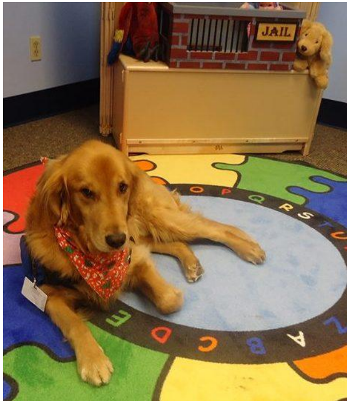
The children who live at Poughkeepsie Children's Home in New York love to have facility dog Ace involved in all of their activities. Ace was trained by Educated Canines Assisting with Disabilities.

Neurobiological research also demonstrates that when children attempt to verbalize and cognitively process the trauma events typically there physiological systems are activated in one of two lines of defense: mobilization for fight/flight (alarm mode) or at the other extreme in a shutdown or dissociated state. In order to socially engage and communicate with adults the internal physiological state has to be reset to calm which can only happen when the child feels safe. (Porges, 2011) Facility dogs are unusually calm as a consequence of their temperament and extensive training which helps children to regulate their own physiology and reset to a calm state. Studies have indicated that the presence of a dog accomplishes this more effectively than the presence of a support person. (Beetz et al, 2012) This not only applies to therapy but to courtroom testimony.